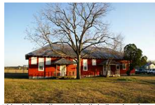
Uhland City Hall was originally built and used as a school house for this farming community located along the historic El Camino Real, a road that later would be known as Old San Antonio Road.

There is nothing left these days to show of the fierce battle that took place on Plum Creek near Kyle along the El Camino Real de los Tejas. But residents of Uhland say arrowheads are plentiful in the area, so plentiful they are easily found lying on top of the ground. And when the wind blows through the old oak trees you can close your eyes and almost hear the horses snorting. The occasional car coming down the road sounds like hooves on gravel. They are the ghostly memories of the Battle at Plum Creek fought by Texans, Mexicans, and friendly Indians against the Comanche's on August 11, 1840. When the Texans and their friends, outnumbered four to one, won a decisive victory against a formidable enemy who was returning after sacking the town of Linnville.